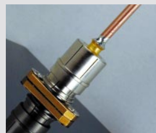
Leave plug collar retracted for convenient snap-on mating (ideal for component testing—repeated mating will not damage SMA jacks).