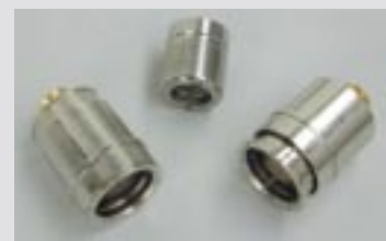
The EZ QuickSnap System... U.S. Patent Pending