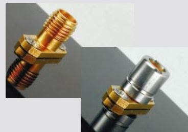
Just screw the adapter onto any SMA jack—no torque wrench needed.

Call for more information, and see how the versatility of EZ QuickSnap plugs and cable assemblies can liberate your system design.